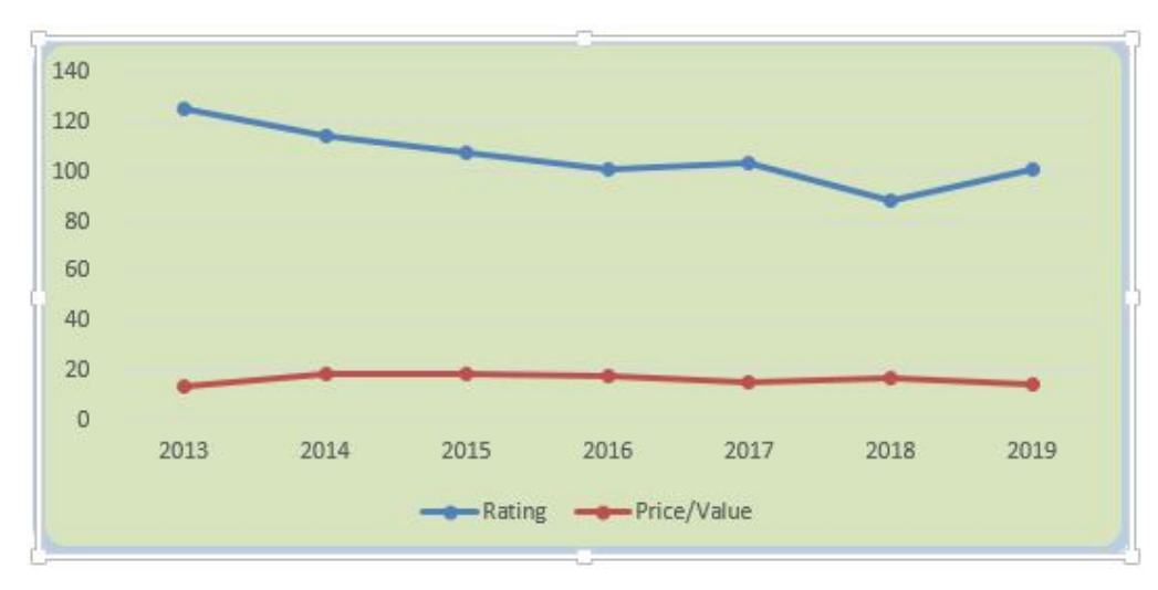
Figure 4. Results of Science and Technology in Azerbaijan in 2013–2019 [8]

ical reforms, modernization of the country. Much work has been done in this direction in recent years. We pursue a broad modernization policy in our country. This policy will allow us to become less dependent on energy resources".